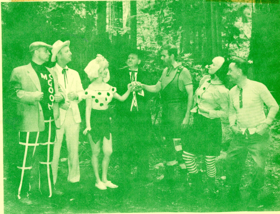
A scene from the 1961 production "Li'l Abner"