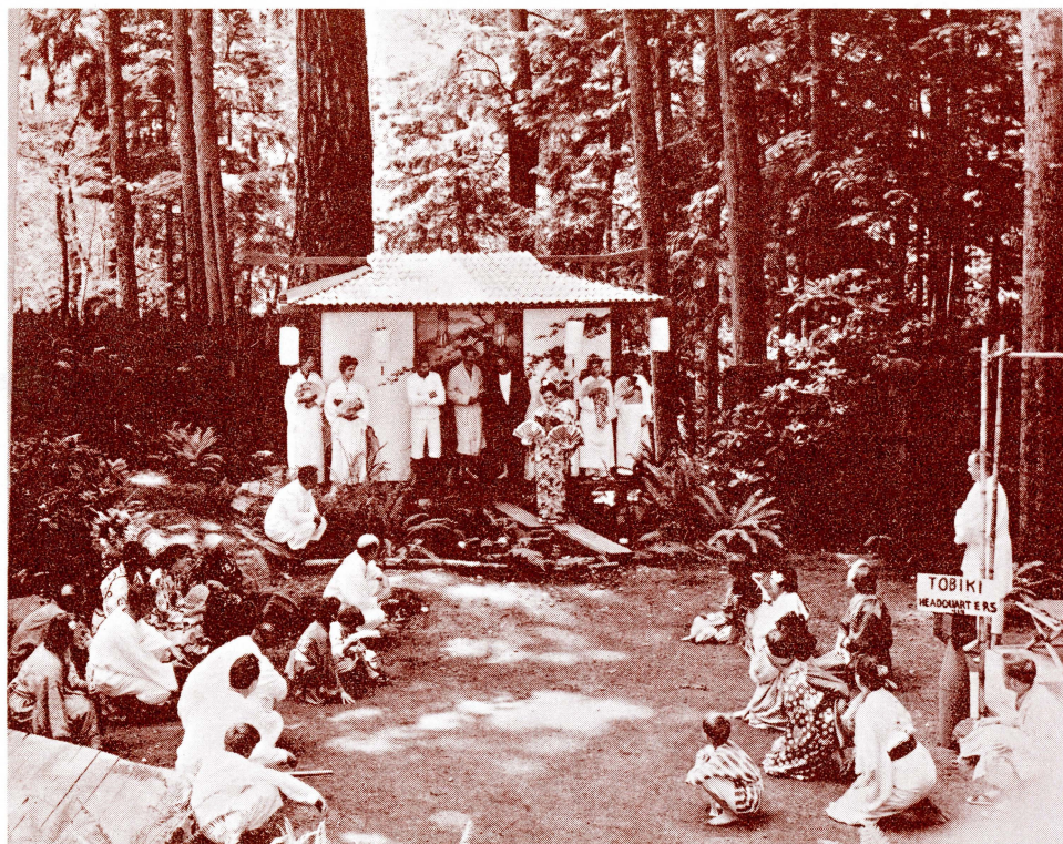
A scene from the 1957 production "Teahouse Of The August Moon"